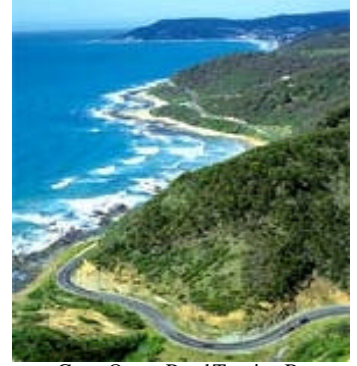
Great Ocean Road Touring Route

5 Days/ 4 Nights.....From US$573 Per Person (Tourist Superior) From US$752 Per Person (First Class)