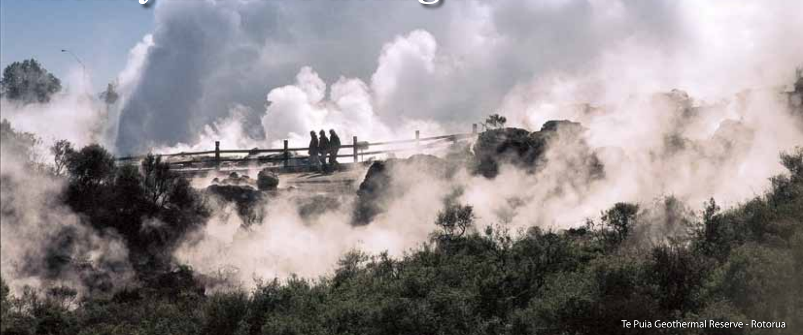
Te Puia Geothermal Reserve - Rotorua