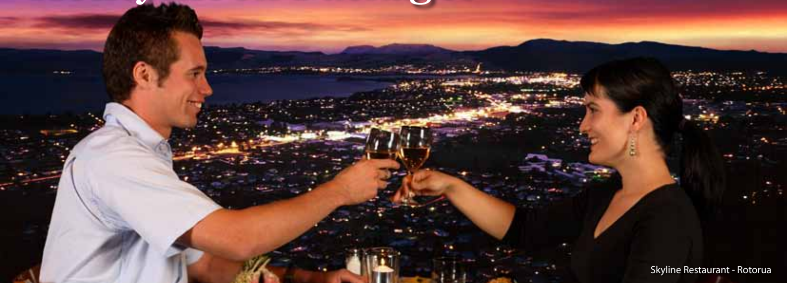
Skyline Restaurant - Rotorua